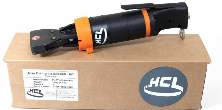
Original Tool Carton with generic tool example shown

Storage: Tool should be installed and used in a dry environment. When not in use store in a cool dry area in original carton.